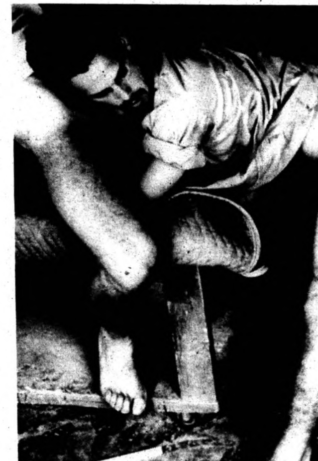
The men above are seeking something obviously....in the hot picture, FLESH FANTASY now at the Beautiful NOB HILL CINEMA, 729 Bush. (No, the peachier isn't in the film!!!!!!)