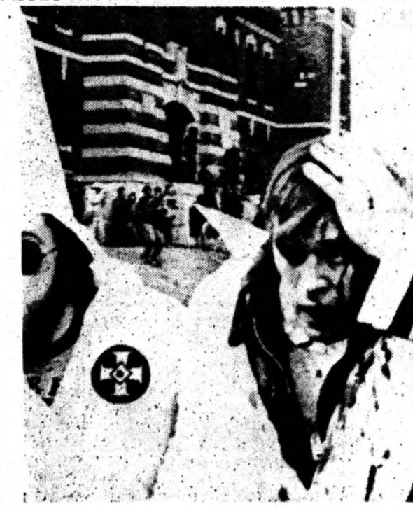
MERIDEN, Conn. The Ku Klux Klan got their asses kicked on the 21st of March when they tried to show their sick hate-filled faces in this northern city of 60,000. The cops saved them.

"LOOKIN' GOOD!" THE KKK GETS THEIR ASSES KICKED AND HEADS KNOCKED ON!