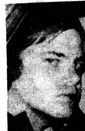
Hinkley, a former Nazi.

WOULD-BE-ASSASSIN WAS MEMBER OF NEO-NAZI GROUP IN NORTH CAROLINA WHICH SHOT AND KILLED FIVE PEOPLE!