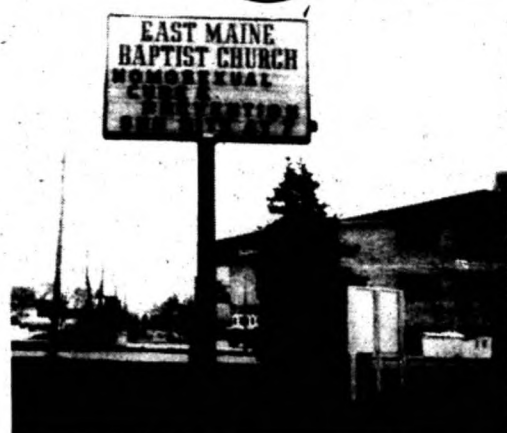
BROWN BILL BACKLASH GROWS.....! FUNDAMENTALIST CHURCHES ATTACK!