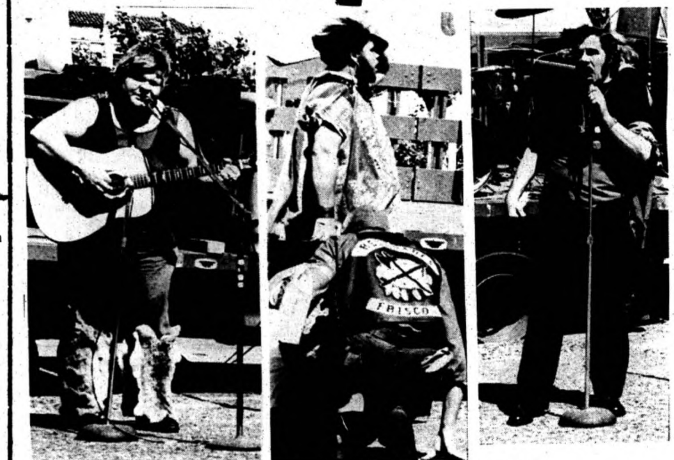
SCENE FROM THE FESTIVAL OF GAY LIBERATION

The entire event was most positive, and there were none of the drugs and the naked acts that took place at the other event. Gay support for socialism is growing, and can't be stopped!