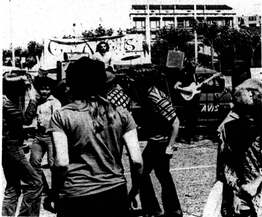
Scene from the Festival of Gay Liberation

Use the community bulletin board at the HELPING HANDS CENTER . Find a roommate, apartments, rentals to share, etc. Come in and list yourself on the Helping Hands Community Bulletin Board, 225 Turk Street, downtown, between Jones and Leavenworth.