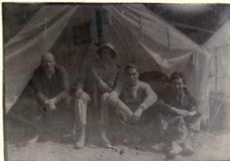
NICKNAMES AND FRIENDSHIPS BLOSSOMED