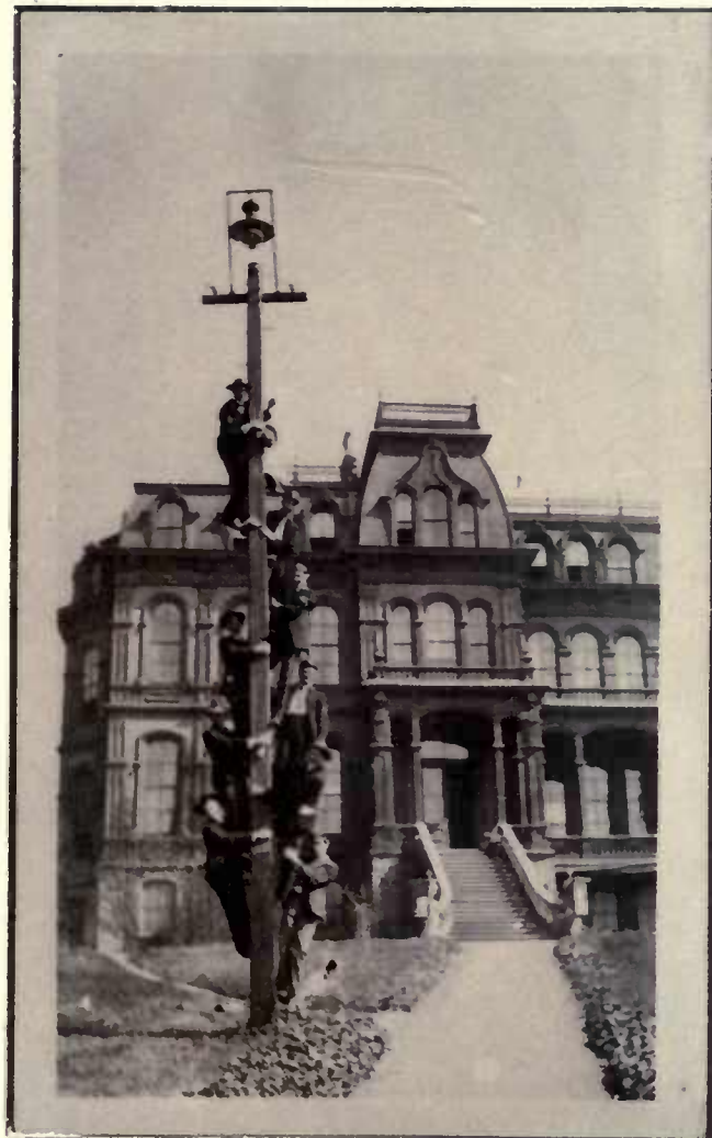
THE HILLSIDE GANG INSTIGATORS OF THE "BIG C"