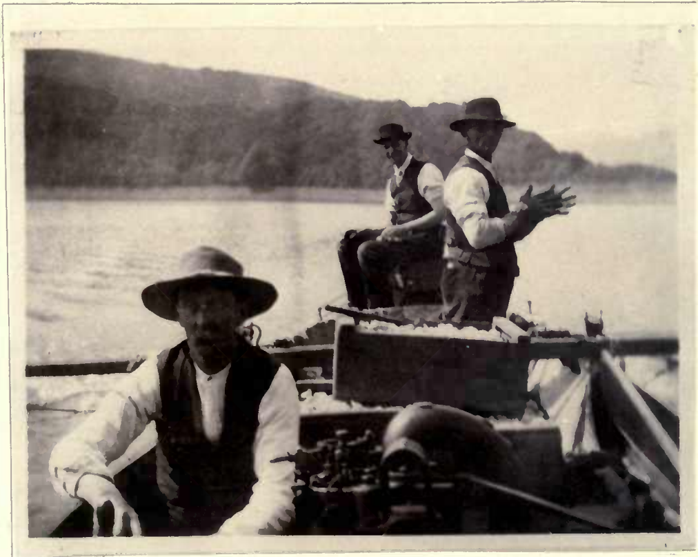
COPPER SULPHATE TREATMENT AT LAKE CHABOT