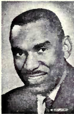
"Superior Schools for a Superior City"