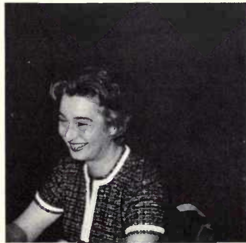
A characteristic smile