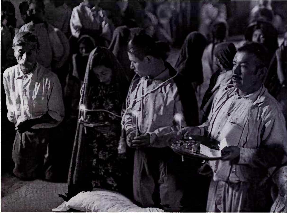
Wedding in Mexico, in a remote village where a priest had not visited for thirty years. 1952.