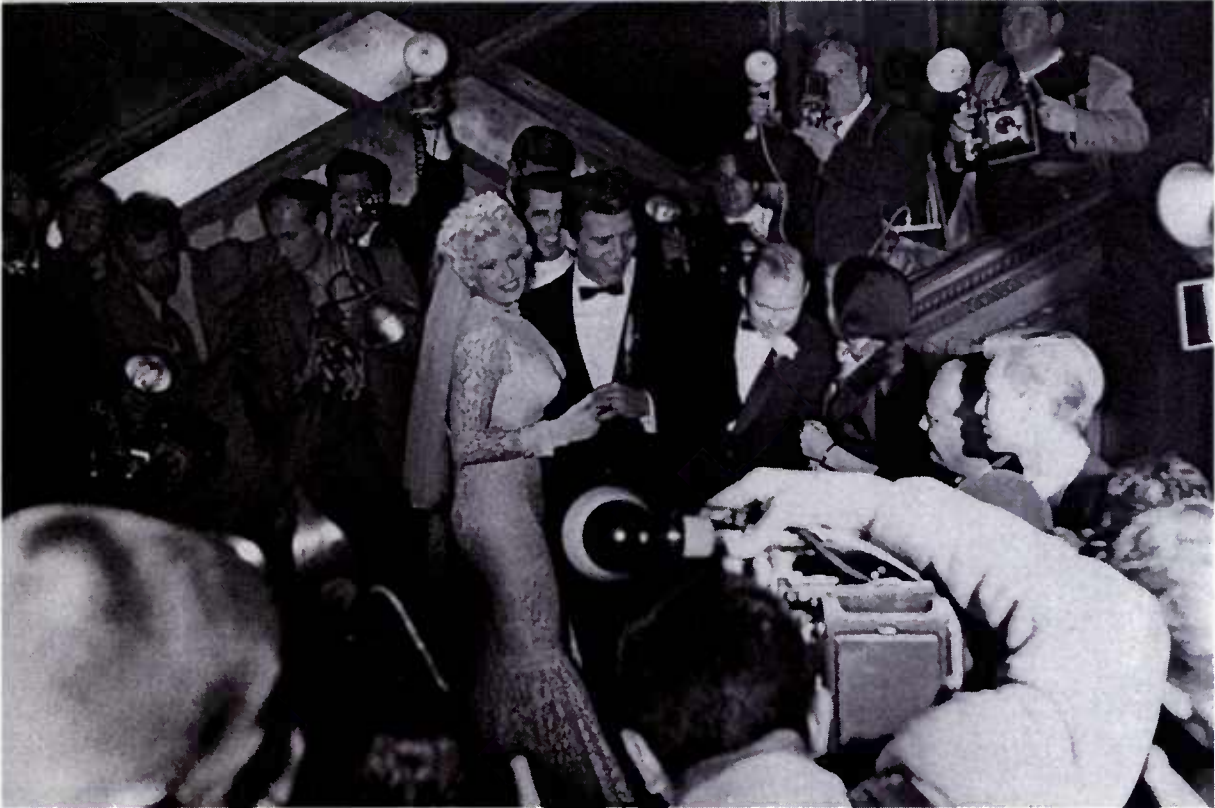
Wedding of Jayne Mansfield and Mickey Hargitay. Los Angeles, 1958