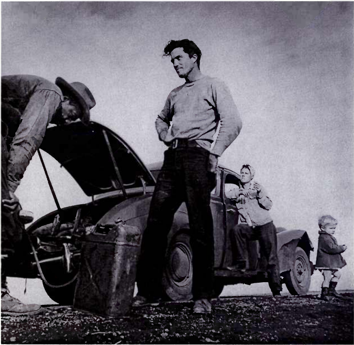
Migrant workers' camp. San Joaquin Valley, California, 1950