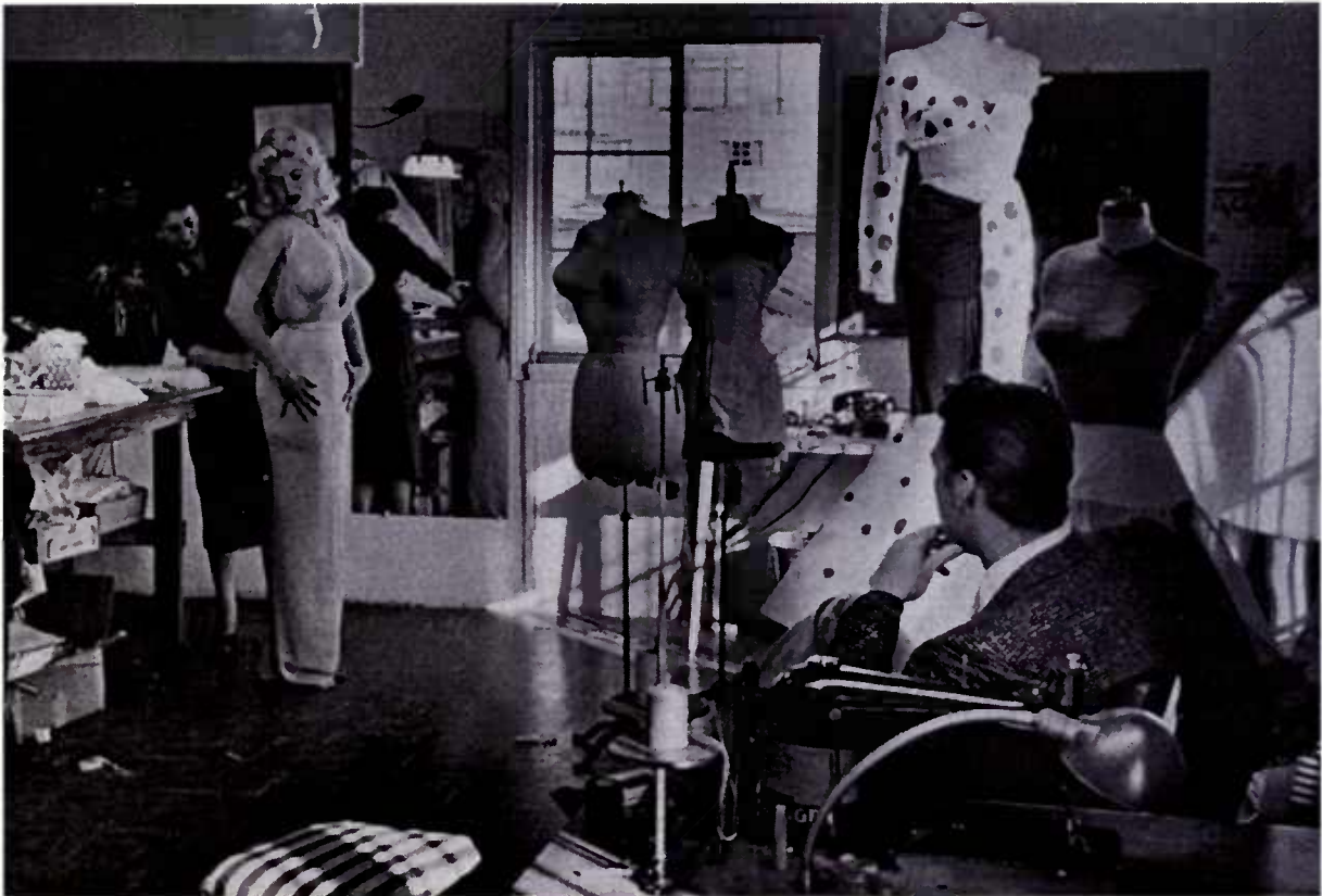
Jayne Mansfield and fiance, Mickey Hargitay. Los Angeles, 1958