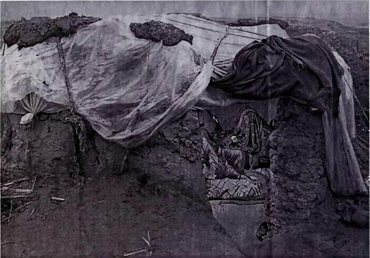
December 11, 2001.