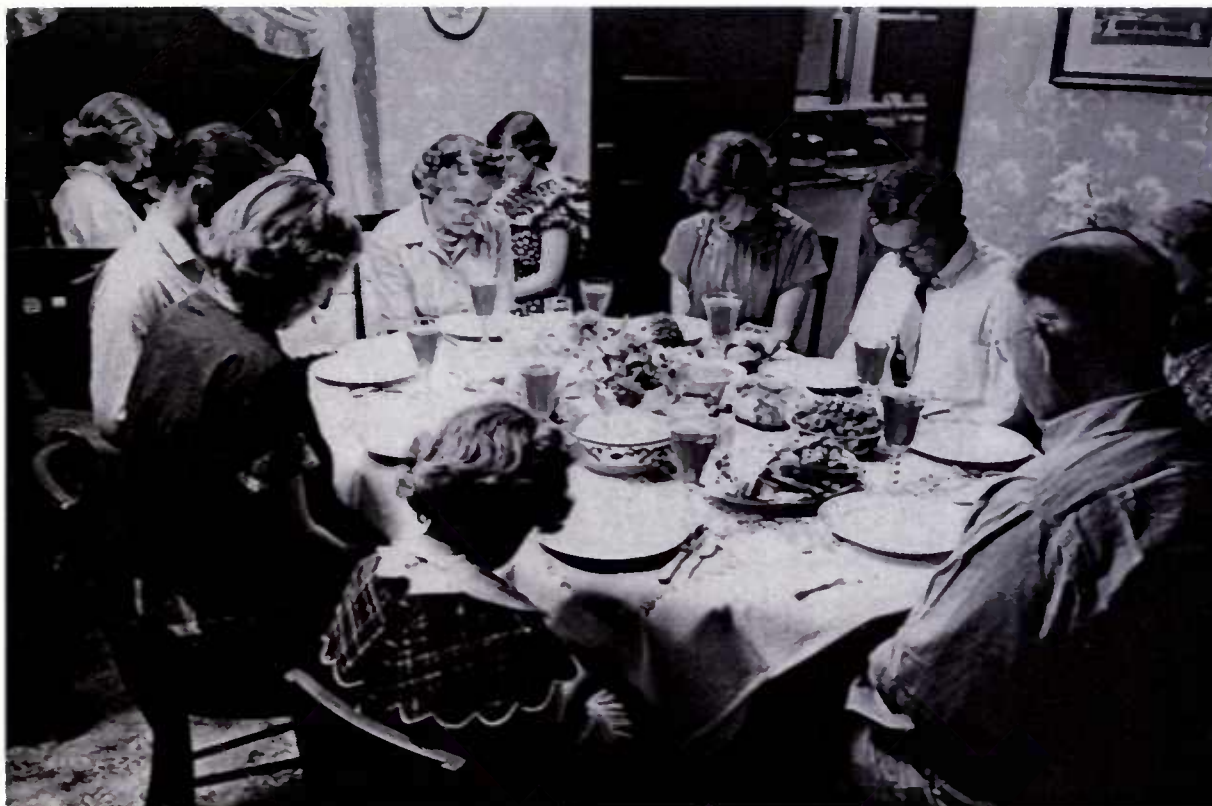
Saying grace. Lebo, Kansas, 1950