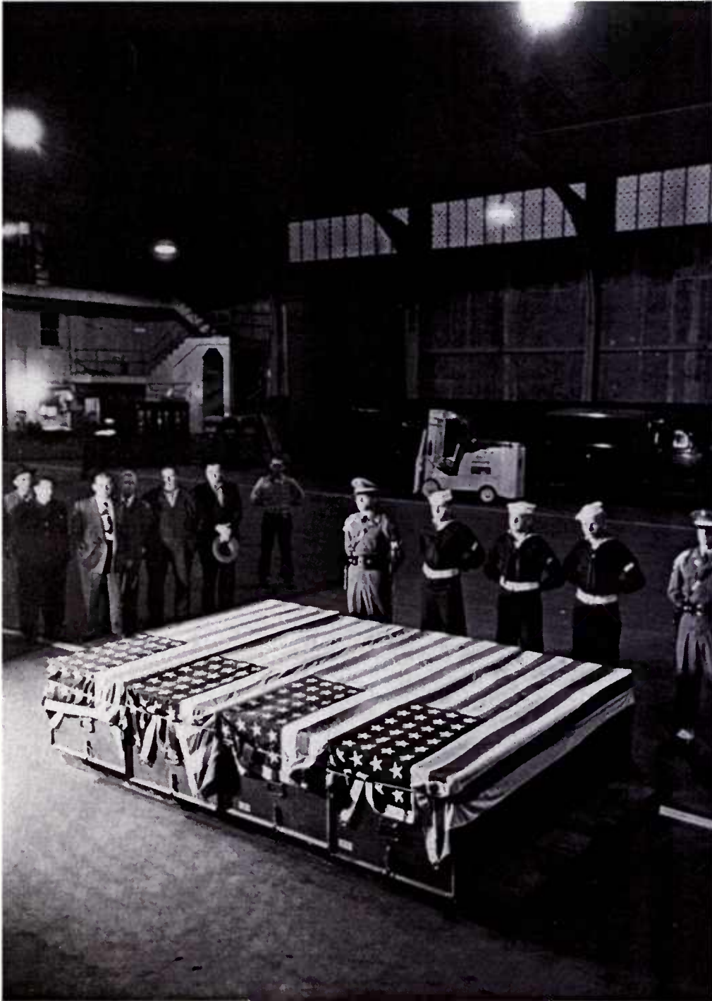
The first dead from the Korean War. San Francisco, 1951