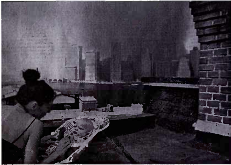
New York Times, November 18, 2001.