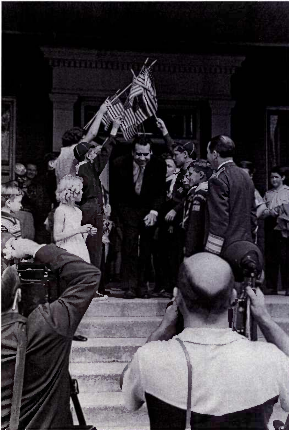
Senator Nixon visiting his hometown school. Whittier, California, 1952