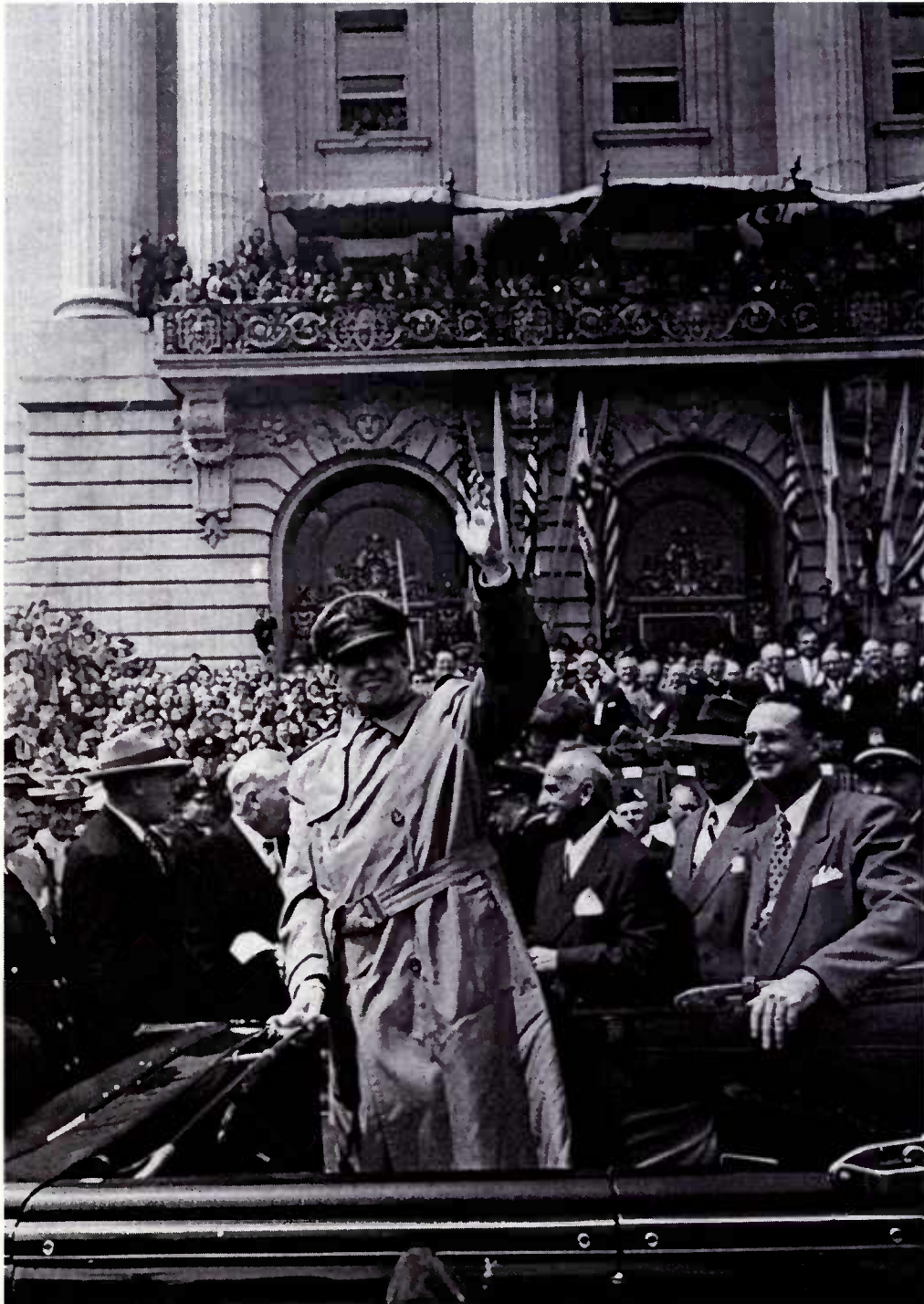
General Douglas MacArthur on his return from Korea. San Francisco, 1951