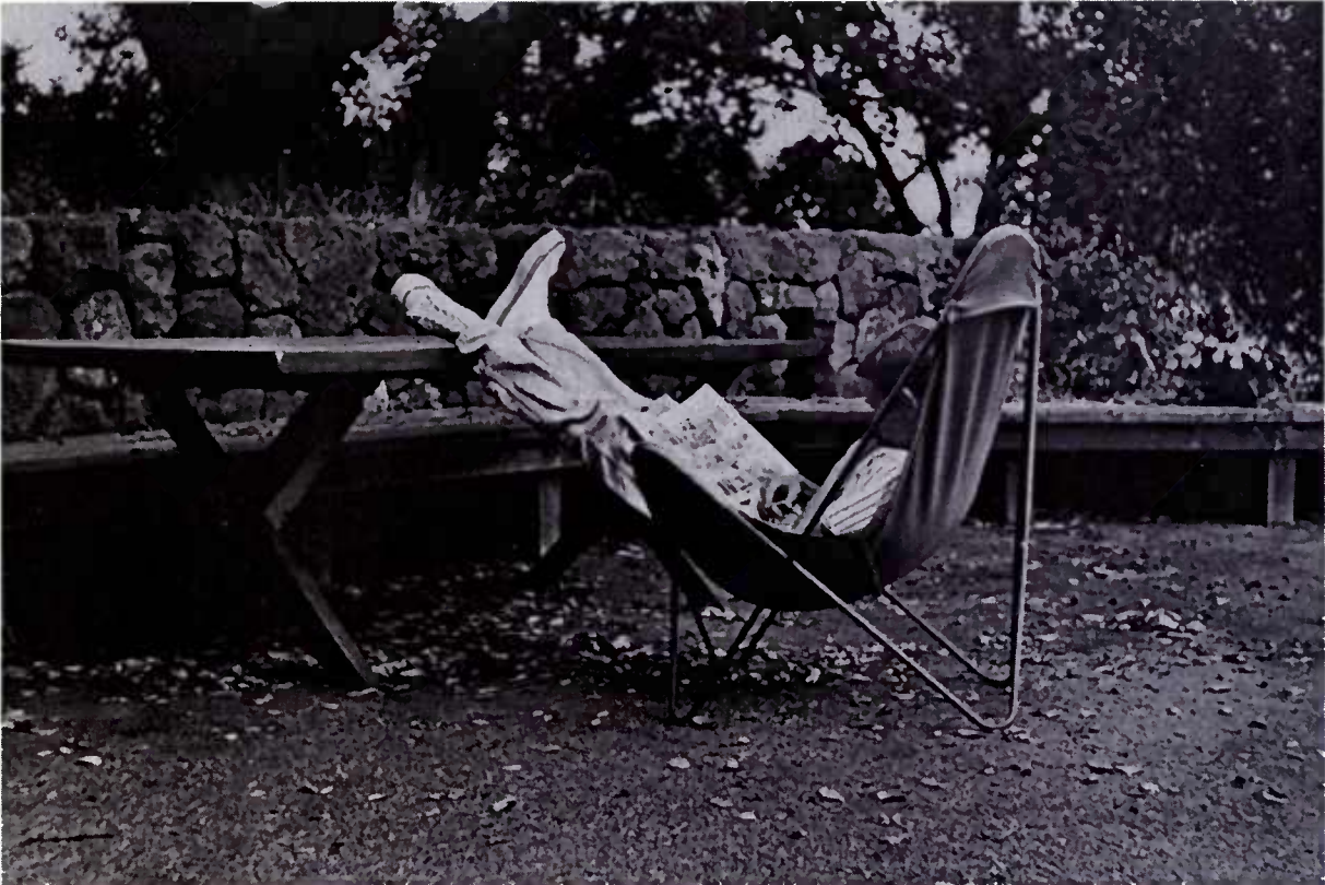
Backyard. Orinda, California, 1954