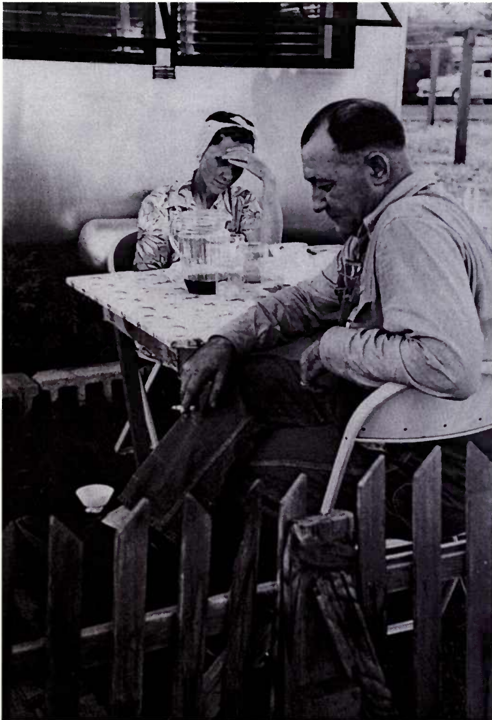
Older couple living in trailer park. Richland, Washington, 1952