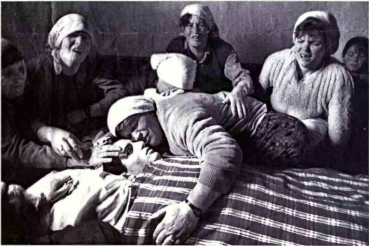
Alan Chin for the New York Times , November 14, 2001.