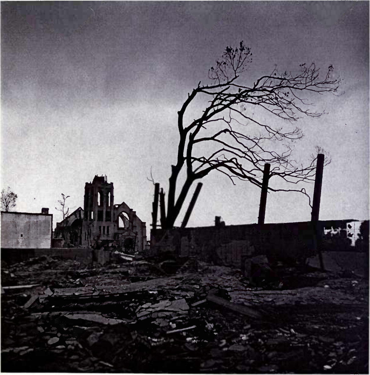
Entering Hiroshima. August, 1945