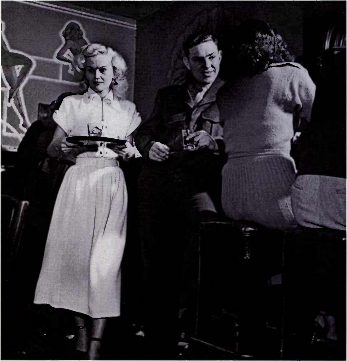
Returned Korea veteran in a bar. San Francisco, 1951