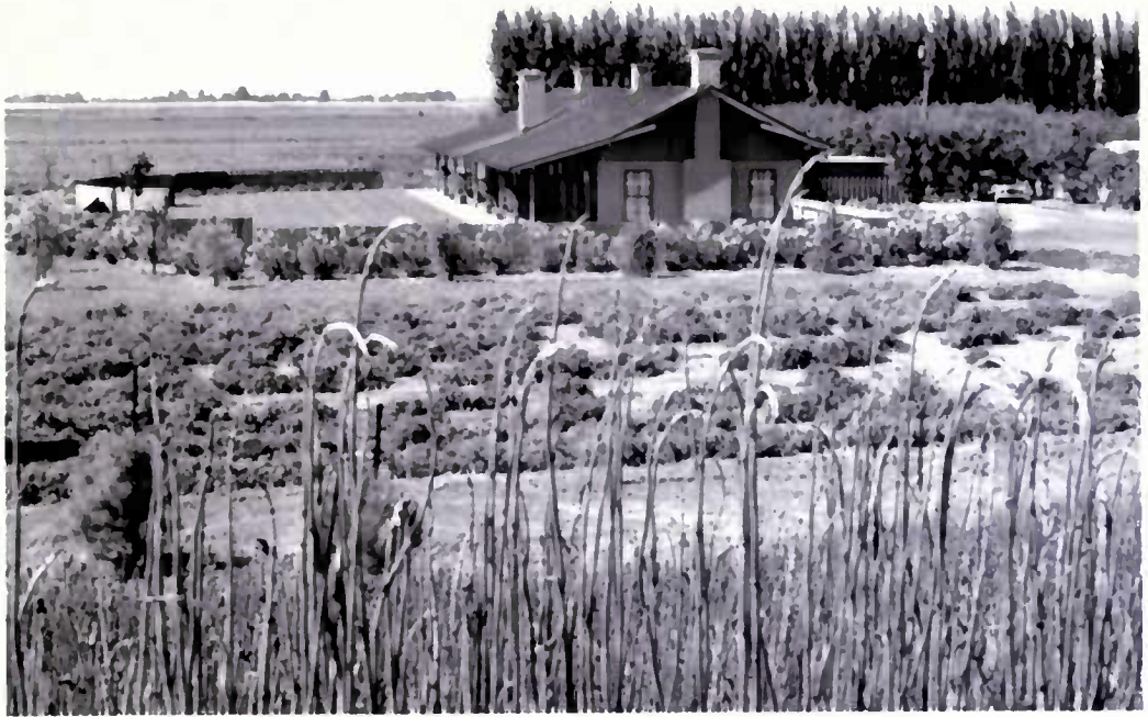
The Gwerder home, 1965