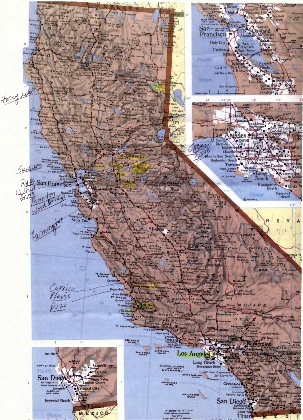
Gwerder Family Agricultural Lands