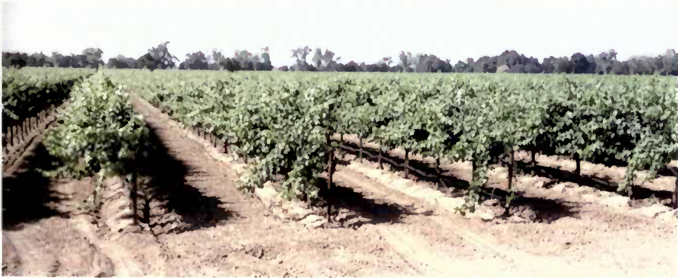
Gwerder Vineyard (Galt, California)