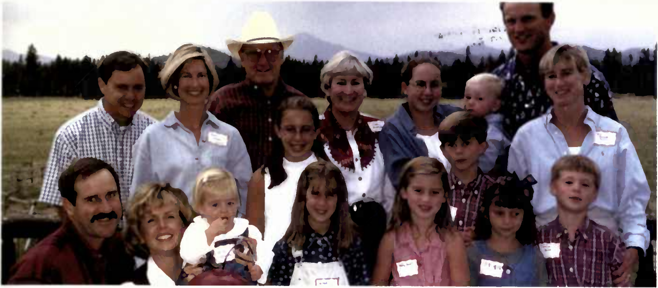
The Gwerder family, 1998