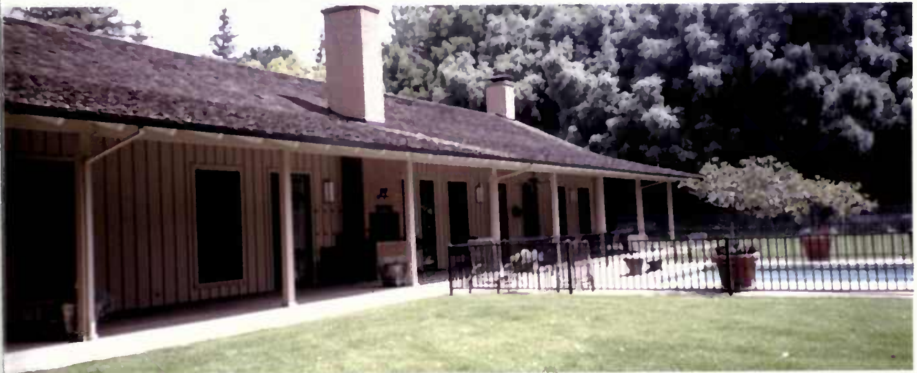
The Gwerder home, 2002