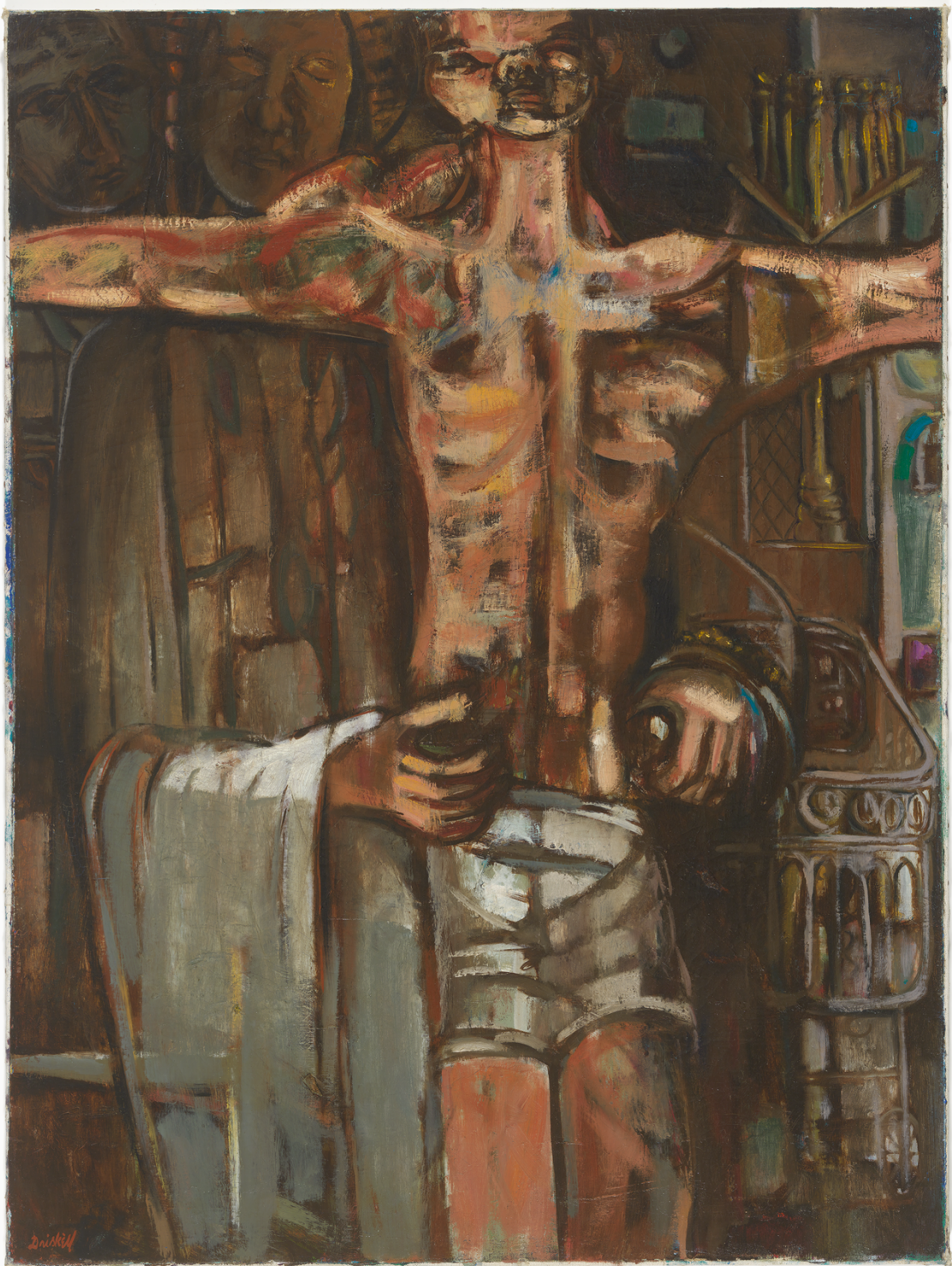
David C. Driskell, Behold Thy Son, 1956, oil on canvas Collection of the Smithsonian National Museum of African American History and Culture