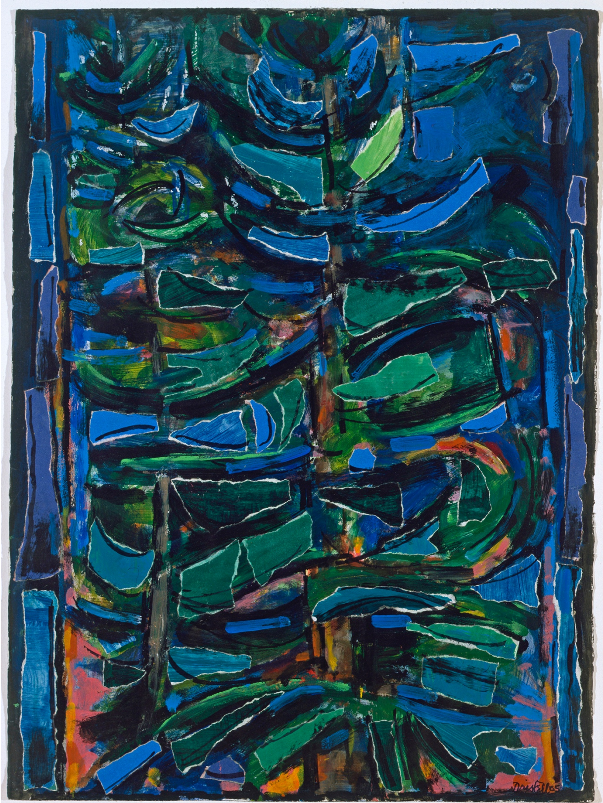
David C. Driskell, Pine Trees at Night , 2005, collage and mixed media on paper