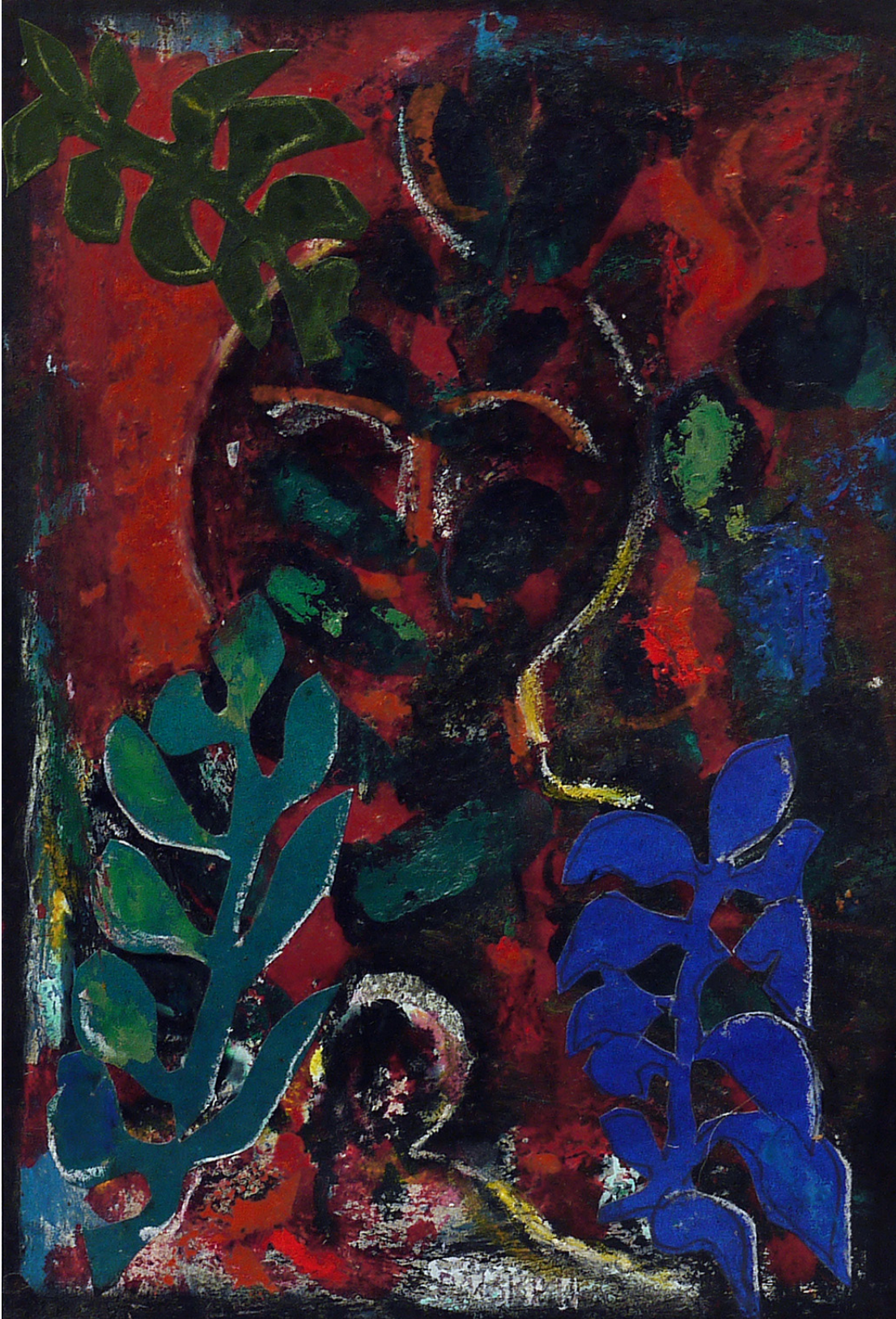
David C. Driskell, Mask Watch , 2005, collage and oil on paper