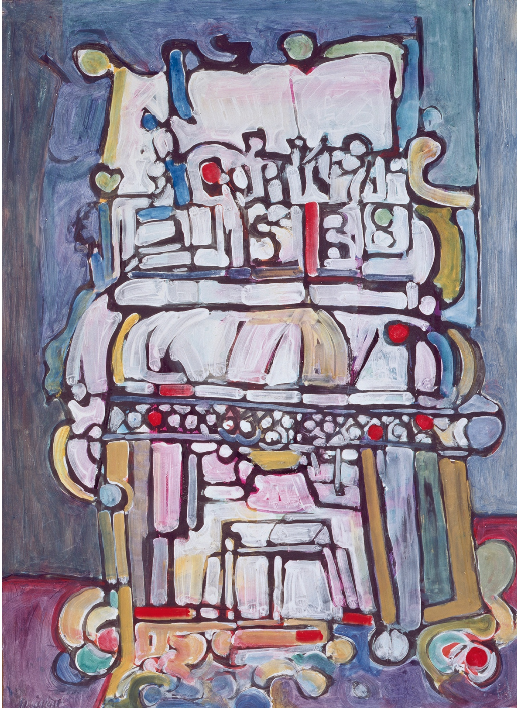
David C. Driskell, The Organ #2 , 2005, gouache on paper