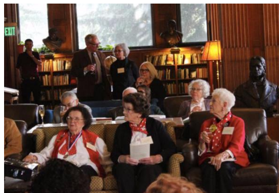
Three Narrators from our Rosie the Riveter Oral History Project at our recent event

The 2015-2016 school year recently wrapped up at the Oral History Center with what has become a new and thriving tradition: the annual Oral History Graduation! In late April or early May over the past four years, we have hosted our very commencement ceremony in which we celebrate the oral histories completed over the past year. This special event gives us an opportunity to thank our interviewees for the often considerable time they give to our projects and to the sponsors who make those projects possible. This year we were especially honored to have many of our interviewees in attendance... [ Read more ]