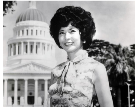
Former California Secretary of State March Fong Eu

important interviews in our collection of women who, against tremendous odds, broke through glass ceilings and forged their own path in the political arena. Over the next few months, we will feature several of these noteworthy pioneers in our newsletter. Also be on the lookout for a new audio series we are putting together on this very important subject. This month we pay tribute to March Fong Eu , former Secretary of State and member of the State Assembly in California. [ Read more ]