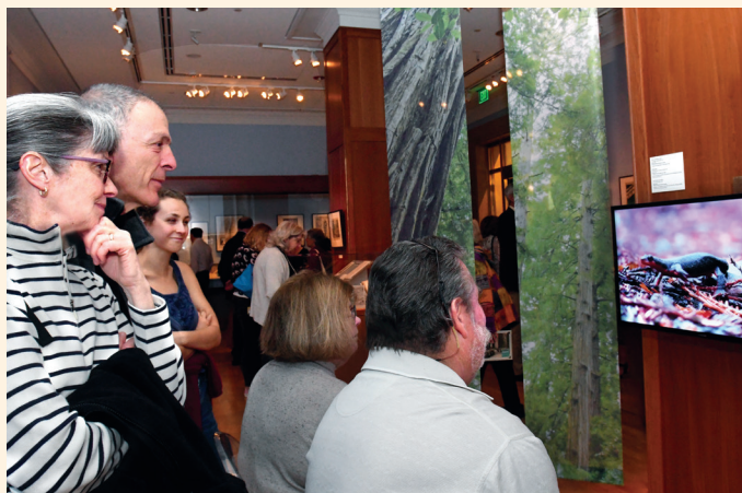
The exhibition featured a multi-media installation on complex forest habitats.