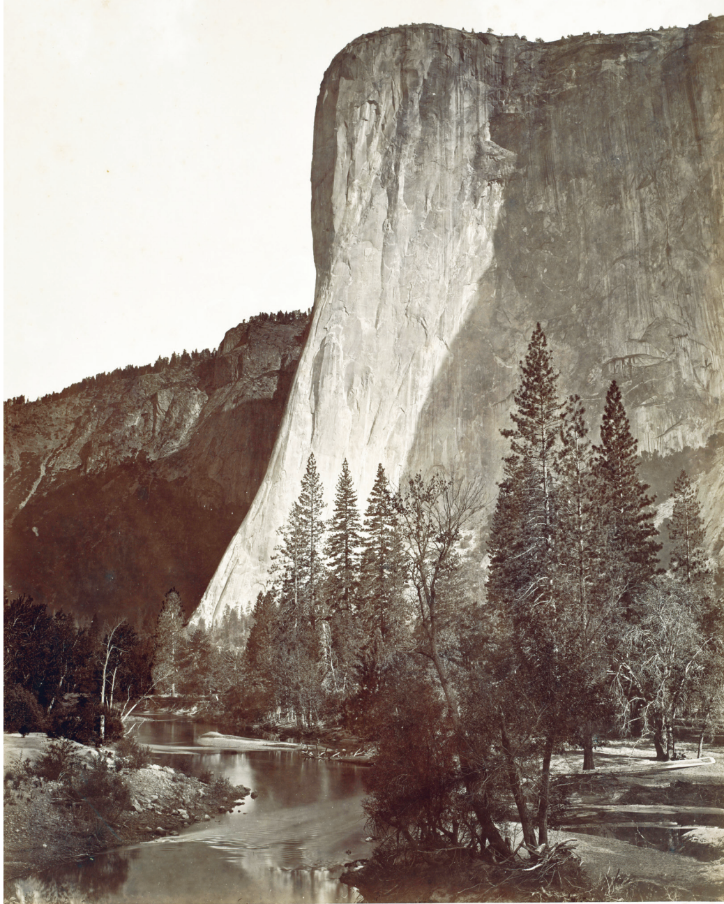
Carleton Watkins, La Capitaine, 3300 feet, circa 1878. BANC PIC 1959.066:14--C

In the nineteenth century, the American West, a seemingly endless expanse of nature, became the principal arena in which the growing struggle between land preservationists and commercial developers of natural resources played out. From the later 1800s to the present, natural resources in the West have often been consumed indiscriminately and with adverse environmental consequences. Mining, lumbering, and agricultural development have all resulted in decimation of natural habitats and deterioration of forests and other landscapes, as well as in loss of native species, including redwood trees, throughout California. Population growth in the West