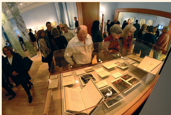
Visitors gather around various installations to learn more about the efforts of Save the Redwoods League