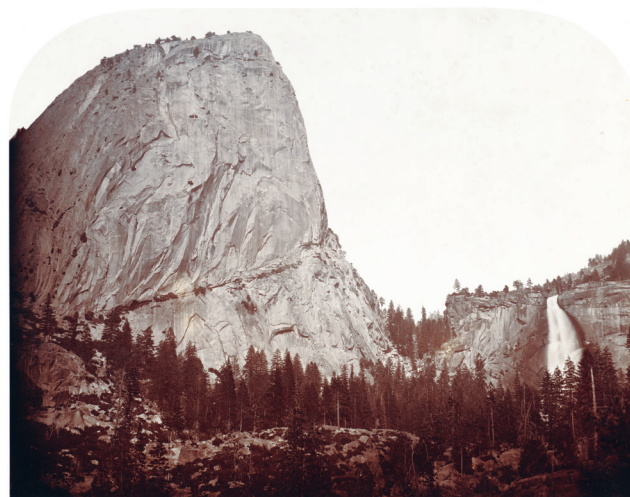
Carleton Watkins, Mount Broderick and Nevada Fall, 1861.