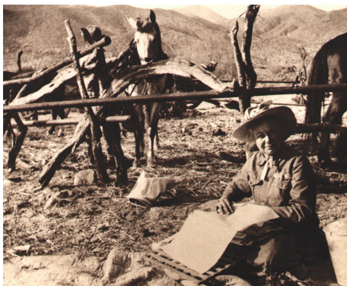
Botanist Alice Eastwood was the longtime curator of botany at the California Academy of Sciences in San Francisco. She worked for the preservation of redwood trees in Humboldt County. In 1953, the California Spring Blossom and Wildflower Association, a group she helped found thirty years earlier, dedicated a grove in her honor. [Alice Eastwood with plant press], 1913, Warner Hot Springs, San Diego Co., Alice Eastwood papers (MSS. 142).