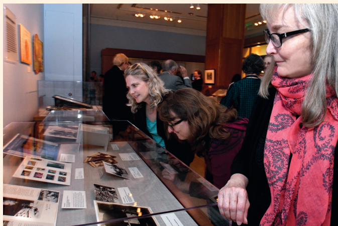
Visitors closely examine materials from the League's collection, which are now available for researchers.