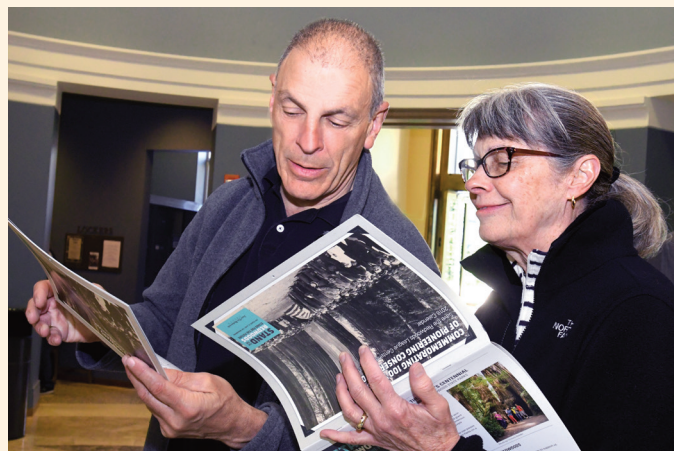
Visitors admire a year's worth of natural beauty in the Save The Redwoods League calendar.