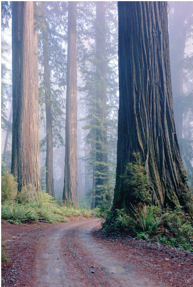
Dirt road curving through a stand of redwood trees. Mill Creek, Jedediah Smith Redwoods State Park. Howard King, December 5, 1964. Save-the-Redwoods League photograph collection. BANC PIC 2006.030--NEG

Land acquisition remained a priority for the League through the twentieth century, but development pressures also dictated intensive lobbying to mitigate the impact of destructive projects. The collection documents this evolution of the League's mission from the 1950s through the 1990s.