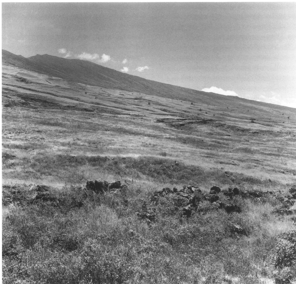
Figure 1.1 View of the Kahikinui uplands in Nakaohu Ahupua'a.

able discharge on only four days (U.S.G.S. 1971:363).