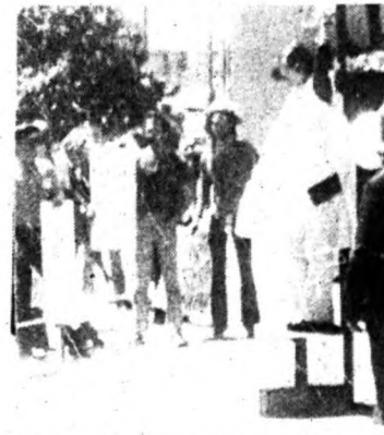
At the 1974 demonstration at Pacific Telephone on Good Friday, "crucifying" a gay, to protest Ma Bell's anti-gay hiring policy for the 3rd year.