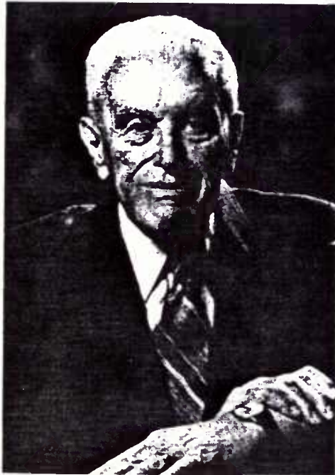
John C. Harsanyi 1920 - 2000