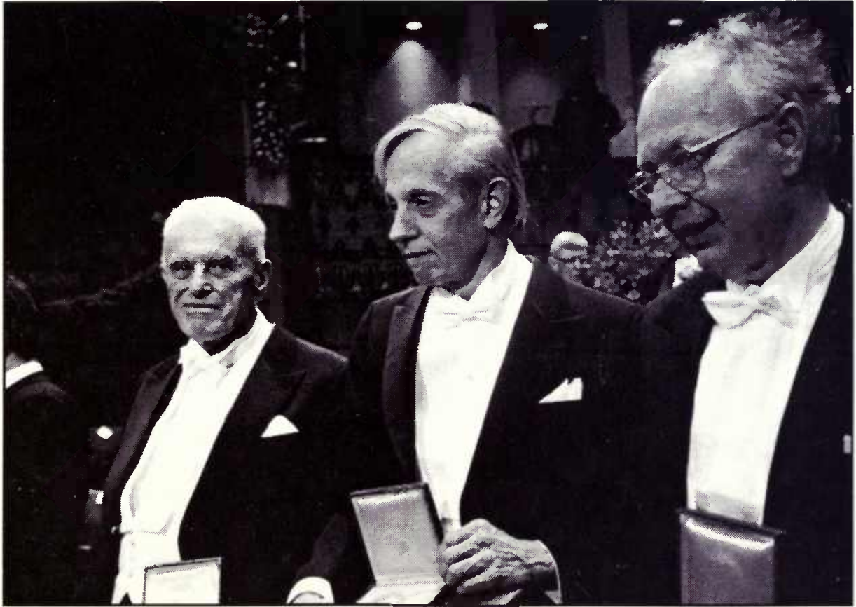
John Harsanyi, John Nash, and Reinhard Selten at the awarding of the Nobel Prize in Economics, Stockholm, Sweden, December 10, 1994.