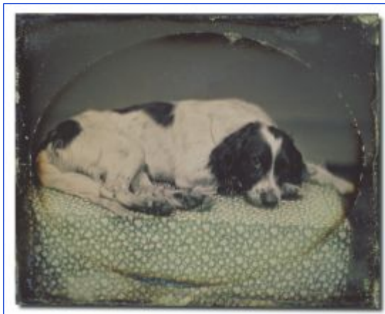
Daguerreotype of dog owned by Sheldon K. Nichols, 1852-53.

speed of several minutes per box, the output from the machine will be ten times larger than ever achieved before in the Preservation Department. The impact on the preservation of the collections will be enormous.