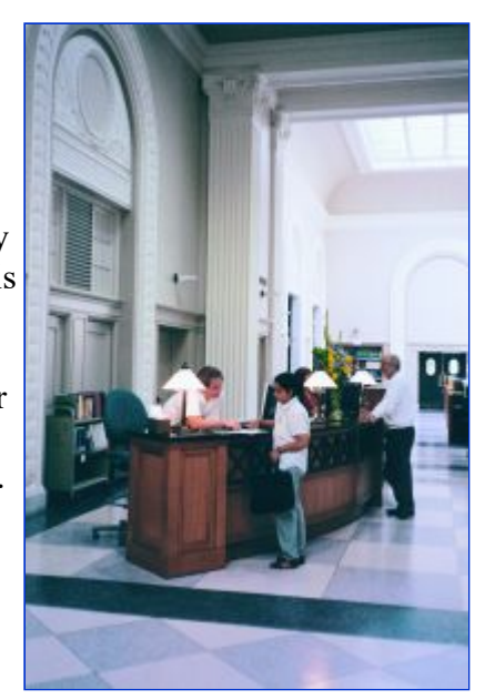
Reference Hall, Doe Library, 2002.

Bene Legere Saecla Vincere is inscribed on the north wall of the East Reading Room in Doe Library Building. Translated, it means "To read well is to master the ages." Scholars in the Humanities and Social Sciences will identify with this quote as they are inspired by the newly remodeled and configured Research Center. This semester The Library is celebrating the opening of the new Reference Center. Harking back to a time of grand architecture, the Reference Center is a single centralized research space developed out of the three great rooms within Doe Library. The Center is comprised of the Reference Hall where the reference desk, Research Advisory Services, special shelving locations for the reference collection, and 34 computer workstations are located. Banked on either side are the North Reading Room, where the Doe Reference Collection is located and the East Reading Room (formerly known as GSSI) location of Government Documents Reference