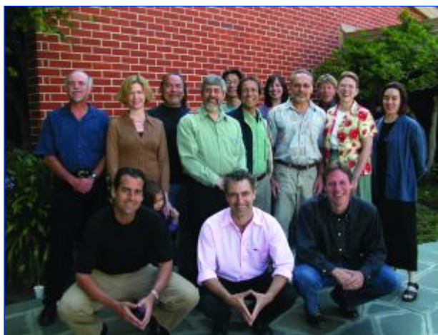
2004 Mellon Faculty Fellows.

In one of the most exciting and far-reaching programs taking place today, Cal's librarians are working with faculty and staff campuswide to redefine the way undergraduate courses are taught and how undergraduates conduct scholarly research. The Mellon Library/Faculty Fellowship for Undergraduate Research is made possible through a $749,000 grant from the Andrew W. Mellon Foundation. The goal of this four-year project is to develop faculty that believe information competence, research skills, and the effective use of library resources are critically important tools for undergraduates to acquire.